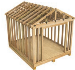
EXTERIOR GENERAL CONSTRUCTION PROJECTS