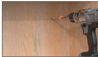
INTERIOR GENERAL CONSTRUCTION PROJECTS