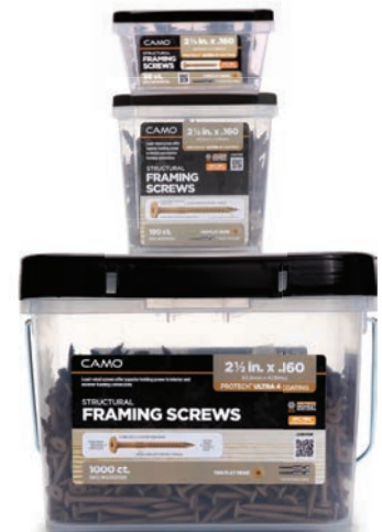
AVAILABLE IN 50CT, 150CT, AND 1,000CT.

Our industry-leading coating protects your connections against the harshest environmental elements. And we've got your back - our products are guaranteed by a Lifetime Limited Warranty. Trust CAMO® when your connections count. Read the full warranty at camofasteners.com