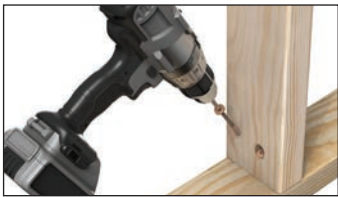
WOOD-TO-WOOD FRAMING CONNECTIONS