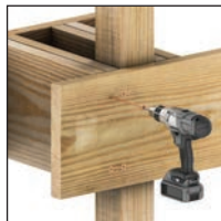
DECK POSTS, BEAMS + RAILINGS