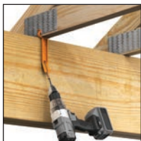
TRUSS AND RAFTERS