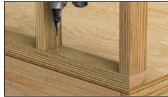
BOTTOM PLATE TO RIM BOARD