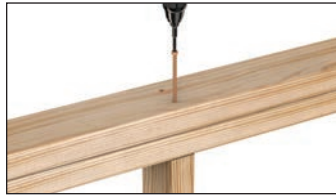
DOUBLE TOP PLATE TO STUD