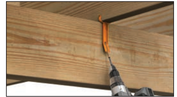
BEAM TO JOIST