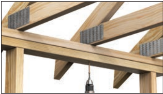
DOUBLE TOP PLATE TO TRUSS+RAFTER