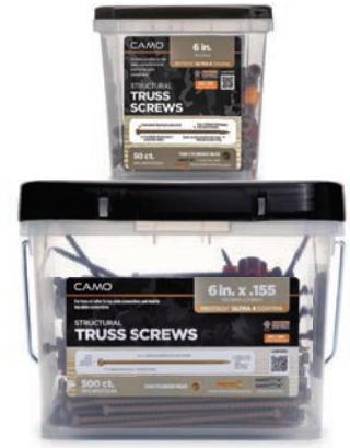
AVAILABLE IN 50CT AND 500CT.

Our industry-leading coating protects your connections against the harshest environmental elements. And we've got your back - our products are guaranteed by a Lifetime Limited Warranty. Trust CAMO® when your connections count. Read the full warranty at camofasteners.com