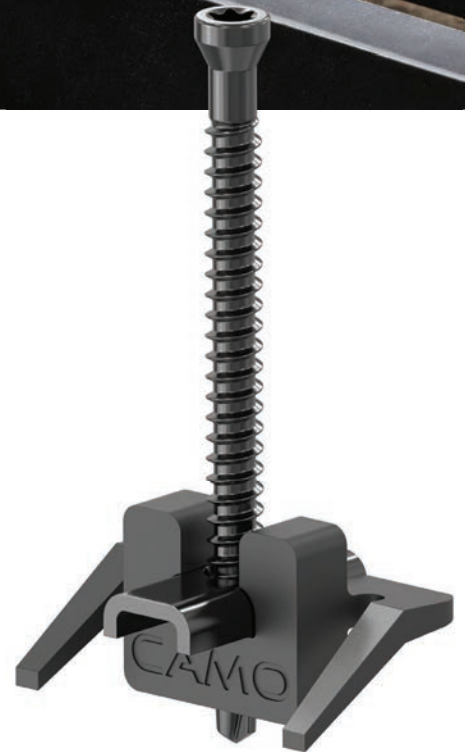
WEDGEMETAL® FOR ANY DECK PATTERN ON 14-18GA METAL JOISTS

WEDGEMETAL® Clips are warranted by CAMO for use with Trex®, TimberTech® by AZEK®, Fiberon®, MoistureShield®, Deckorators®, and other leading brands. Read the full warranty at camofasteners.com